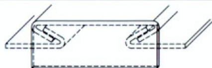
Drive Cleat Detail